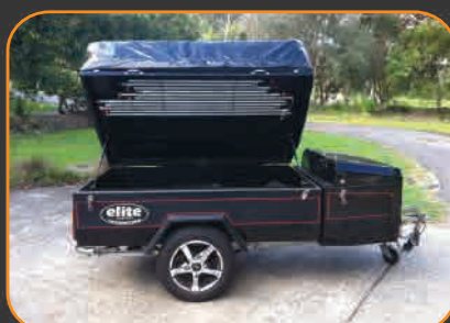
600 litre storage capacity