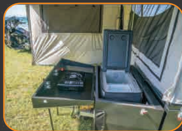
Front Storage Pod with support legs converts to table.