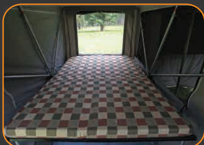
Queen size bed with mattress